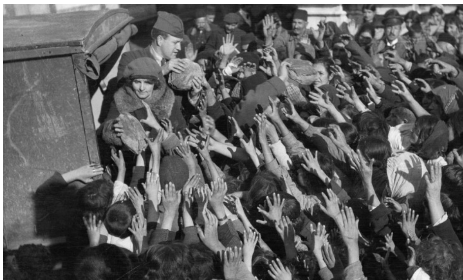
◀ Driven from their homes, Armenians beg for bread at a refugee center.

A Why might a policy like Russification produce results that are opposite those intended?